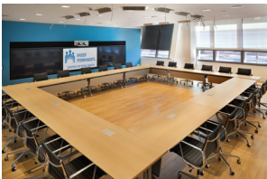
Hollow square: 32