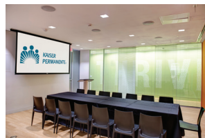
Board room: 15