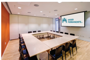
Hollow square: 18