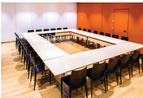
Hollow square: 18