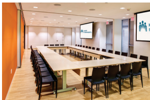
Hollow square: 46