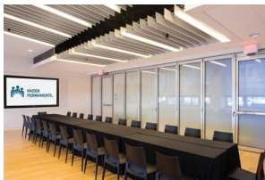
Board room: 25