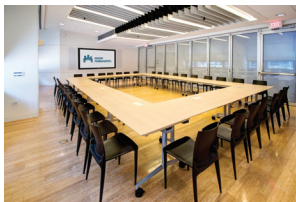
Hollow square: 34